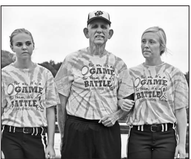
Union County softball players and coaches honor cancer survivors prior to their game with Lumpkin Co. earlier this month.

The worst-case scenario would be two losses and the No. 6 seed, earning Union County a trip to No. 3 seed Banks County.